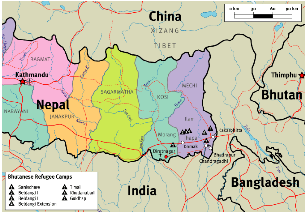
Figure 1. Map of Nepal and Bhutan indicating the location of refugee camps surrounding Damak (Human Rights Watch, 2003).