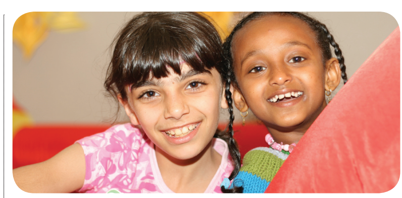
2008 Refugee Children's Party.

Over the past year thousands of immigrants and refugees were impacted by our work primarily in Vancouver, Burnaby, New Westminster and Tri-Cities. The continued success of our work is due in large part to our dedicated and professional staff